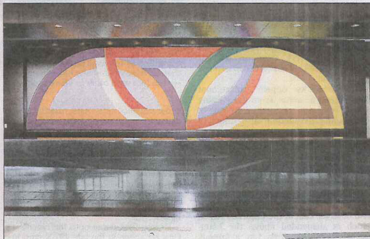
Clockwise from top photo: Maya Lin's "Silver River" hangs above Aria's concierge desk; famed abstract expressionist Frank Stella's "Damascus Gate Variation I" is displayed behind Vdara's concierge desk; Antony Gormley's "Feeling Material XVII," located on the second level of Aria, represents a human body encircled in an energy field.