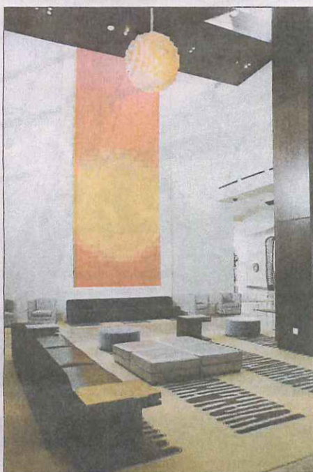
Made of stacked paper, Peter Wegner's "Day for Night, Night for Day" is comprised of two wall pieces — one solar-themed (shown) and one lunar-themed — that face each other in Vdara's lobby.

Upon check-in, Aria guests will be greeted by Maya Lin's "Silver River," an 84-foot silver cast of the Colorado River, which is suspended above the hotel-casino's reception desk. Lin, a famous